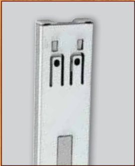
New Mounting Holes and Breathing Tabs