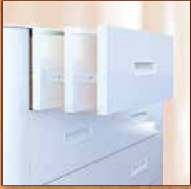
Brings drawers to a smooth and quiet close.