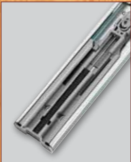
Easy-Close Mechanism re-engineered to reduce friction.