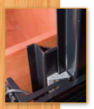
Reinforced Steel Rails