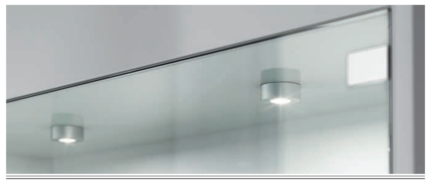
Note Loox Lights and Drivers are "Suitable for use within Closet Storage Spaces"